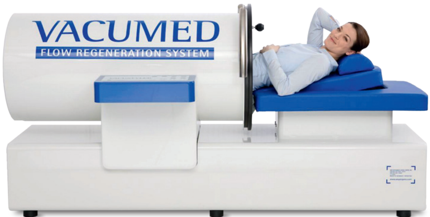
The IVT stands for good tolerance and high patient benefit.

Intermittent vacuum therapy –IVT- applies alternating negative pressure (vacuum) and positive pressure to the lower extremities up to the abdomen. Physiologically this creates a rhythmic vascular dilation and compression and stimulates the >>flow<< in a natural, purely physical way. The result is better circulation, more capillarisation and an increase in the venous and lymphatic return. The central nervous system is also stimulated. The treatment is completely pain-free independent of the disease and its stage, as it functions without compression. The patient remains totally passive. Undressing is not necessary.